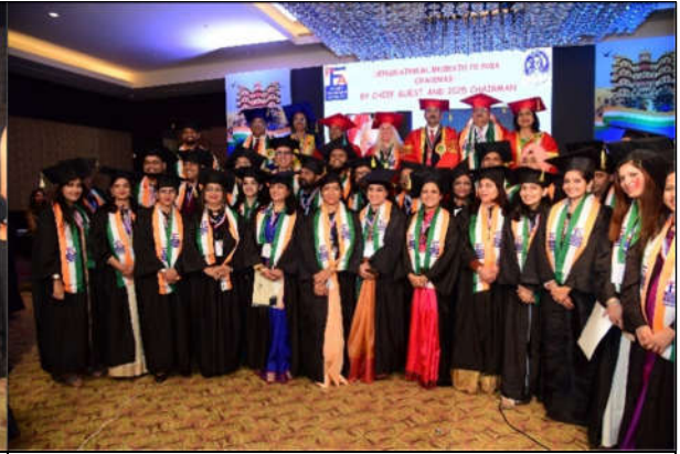
PIC 18 : New Fellows with the Dignitaries