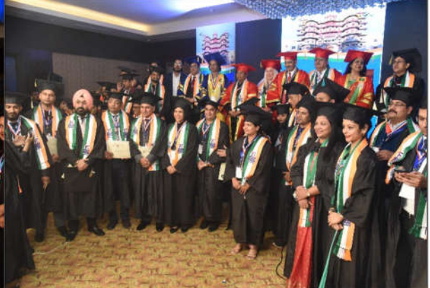
PIC 20 : New Fellows with the Dignitaries