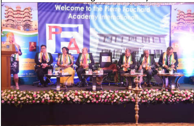
PIC 3 : President, International PFA addressing the audience