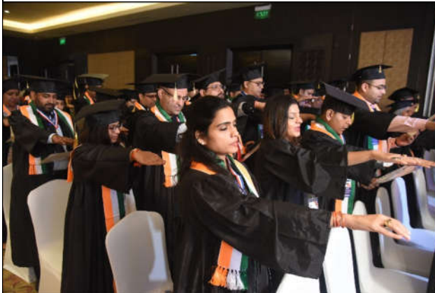
PIC 13 : PFA oath ceremony by the new fellows