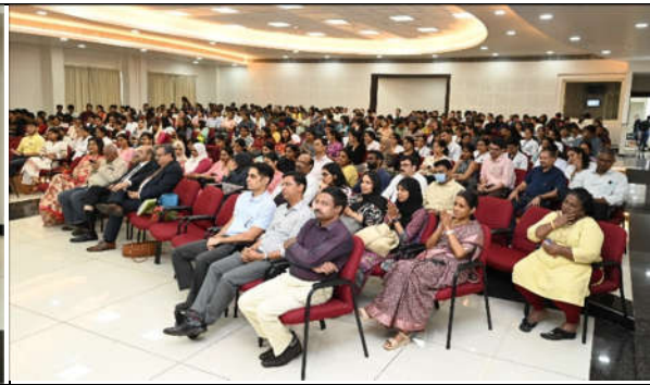
PIC 2 : Audience