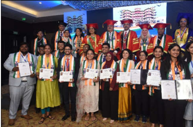
PIC 21 : Student Awardees with the Dignitaries