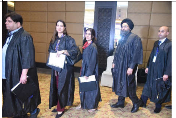
PIC 10 : Convocation procession