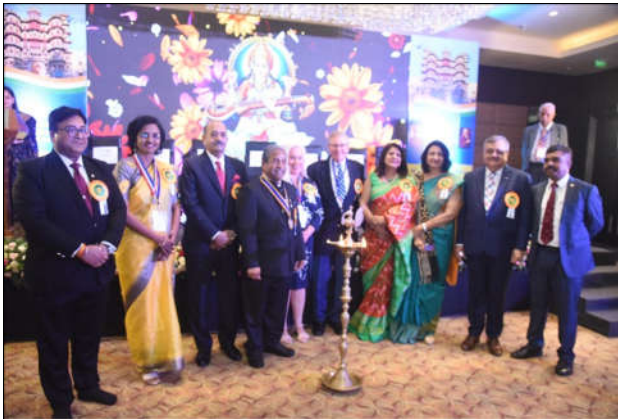
PIC 1 : Inaugural ceremony