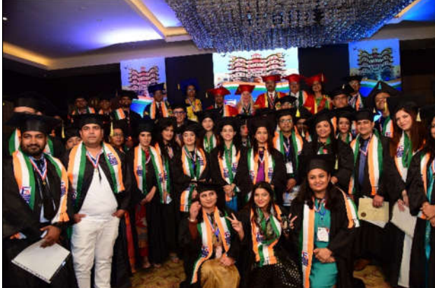
PIC 19 : New Fellows with the Dignitaries