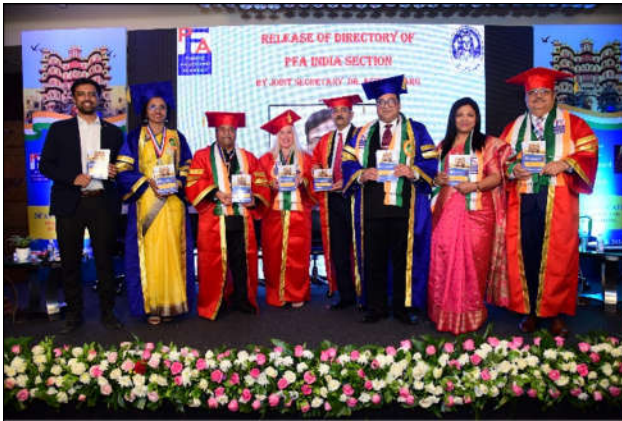
PIC 11 : Release of PFA India Section Directory