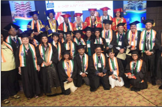
PIC 17 : New Fellows with the Dignitaries