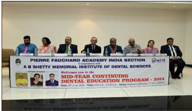
PIC 1: Inaugural Ceremony