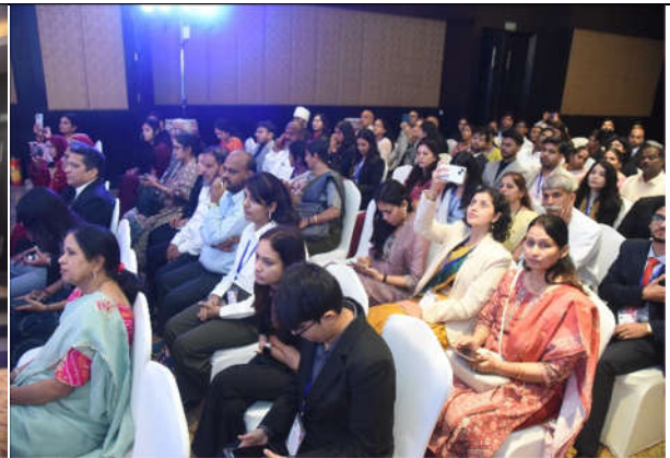
PIC 2 : Audience